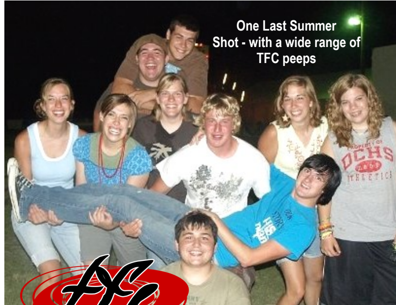
One Last Summer Shot - with a wide range of TFC peeps

Food afterward - but not backward at the Ranch House!