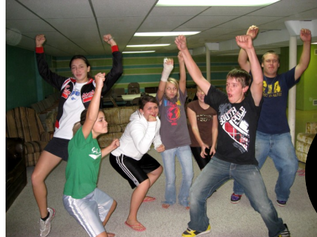
Snap Action Game