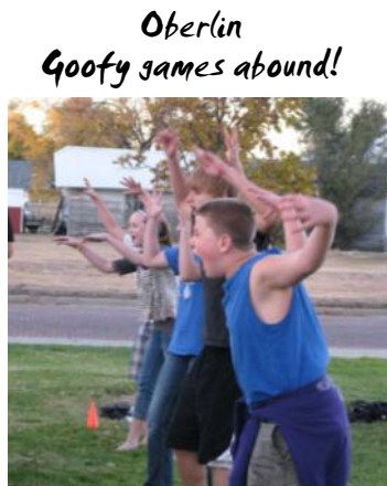
Oberlin Goofy games abound!