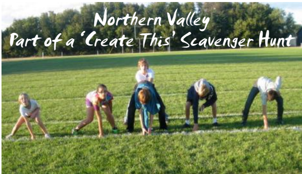
Northern Valley Part of a 'Create This' Scavenger Hunt

Partnering with Shepherd Staff Ministries