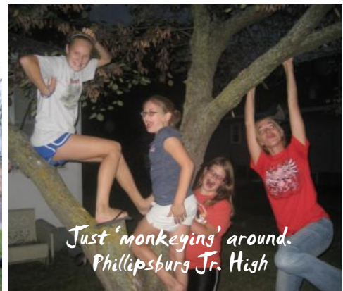
Just 'monkeying' around. Phillipsburg Jr. High

Whether you turn to the right or the left, your ears will hear a voice behind you saying, "This is the way; walk in it." - Isaiah 30:21