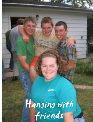
Hanging with friends