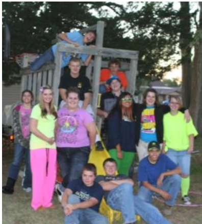
Phillipsburg High School - not to old to play!