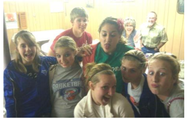
Thunder Ridge - Whatta group!